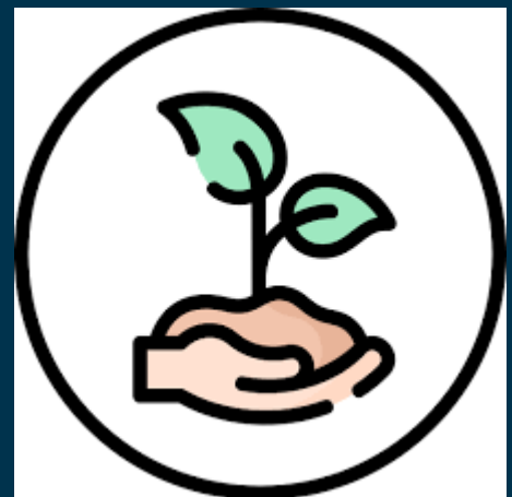
WITH A FOCUS ON RURAL SUSTAINABILITY