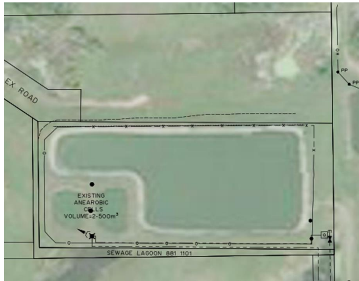
EXISTING LAGOON TREATMENT SYSTEM