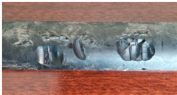
Pictured Above: 2023 Beaver Chew reported by Customer

Leaks on gas lines can develop over time as a result of dig-ups, gopher/beaver chews, wash-outs, lightning strikes and other damage. The County of Vermilion River maintains the largest member-owned natural gas pipeline network in Alberta with over 4,500 km of polyethylene, steel, and aluminum gas lines. We patrol our residential gas system on a 5 year rotation, but we also rely on our customers to assist by reporting potential leaks. Smell, dead vegetation, hard/cracked soil and bubbling in wetlands are all potential indicators of gas leaks. If you notice any of these please call us and we'll come check it out.