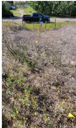
Pictured Right: 2023 Leak found during Patrol