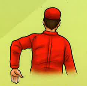
Stop from behind