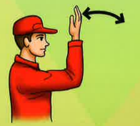
Move to melfollow me