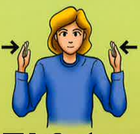
This far to go