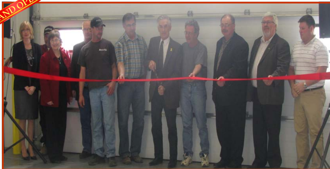
We missed you at our new Maintenance Shop Grand Opening that was held on April 20, 2010.